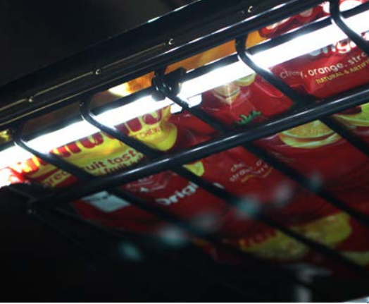
C-Channel (with diffuser)